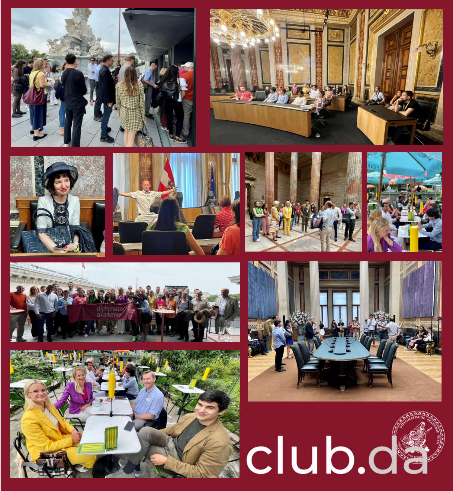
Photo galleries and more information on da .connect: Recordings of livestreams and more videos from the DA:

Excursion to the Austrian Parliament and dinner at Volksgarten Pavillon