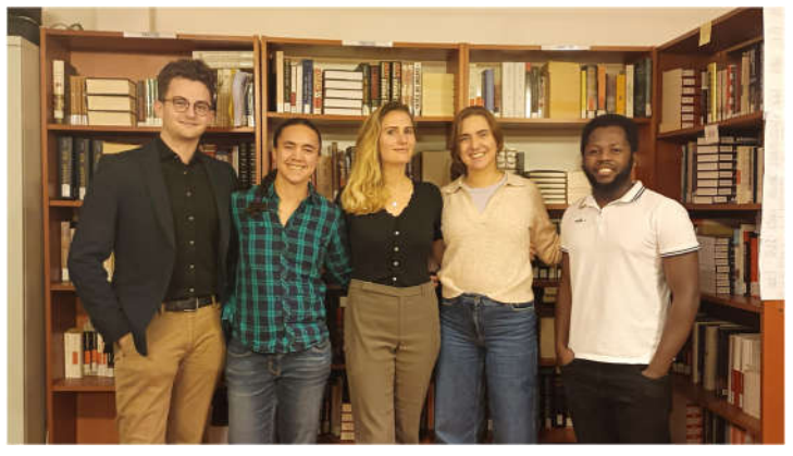
Student Ambassadors 2022/23

The Student Ambassadors take prospective students on private tours of the Academy, providing them with an intimate look into the DA. They also offer virtual sessions, scheduling talks on an individual basis. Please feel free to reach out to them with any questions to get an inside perspective of the DA via student-ambassadors@da-vienna.ac.at !