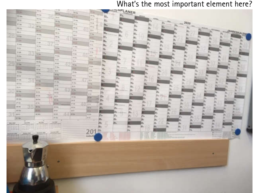
Solution: the life-saving tool in the bottom left corner, what else?!?!