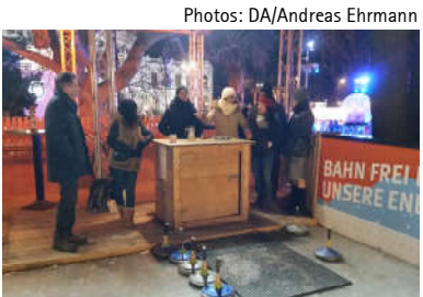
Curling and Skating at Wiener Eistraum